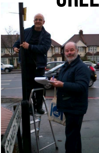
Green activists monitoring air pollution across Enfield

Across the country, Green councillors are making a difference to people's lives. For example, Green Party councillors in Kirklees convinced the council to invest in a £20m home insulation programme and helped residents to save money on heating bills. In Sheffield, Green councillors have been campaigning to protect the city's trees. Across Enfield, Green activists have been campaigning on a range of issues, including traffic congestion, air quality, green waste and more. Green Party councillors guarantee to tackle the things that need to be tackled. We guarantee to challenge the status quo, where the status quo isn't working, and to demand better of our elected councils. And Green councillors will listen to you, the community, taking your concerns, your needs and your ideas to heart. If you've got concerns with Enfield Council, let us know what you'd like the Green Party to do about it! kate@enfieldgreens.org.uk