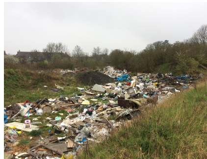
A river of fly-tipped waste near Turkey Brook, where flytipping has been left to continue for months

Enfield Green Party has been surveying residents to find out what you think of local services. We know litter, fly-tipping and waste collections are a priority. We will improve waste services to make it easier for people to recycle, particularly in flats and shared housing. We will introduce more recycling bins in public places and encourage local businesses to adopt greener waste strategies, and make the Council act more quickly to tackle fly-tipping.